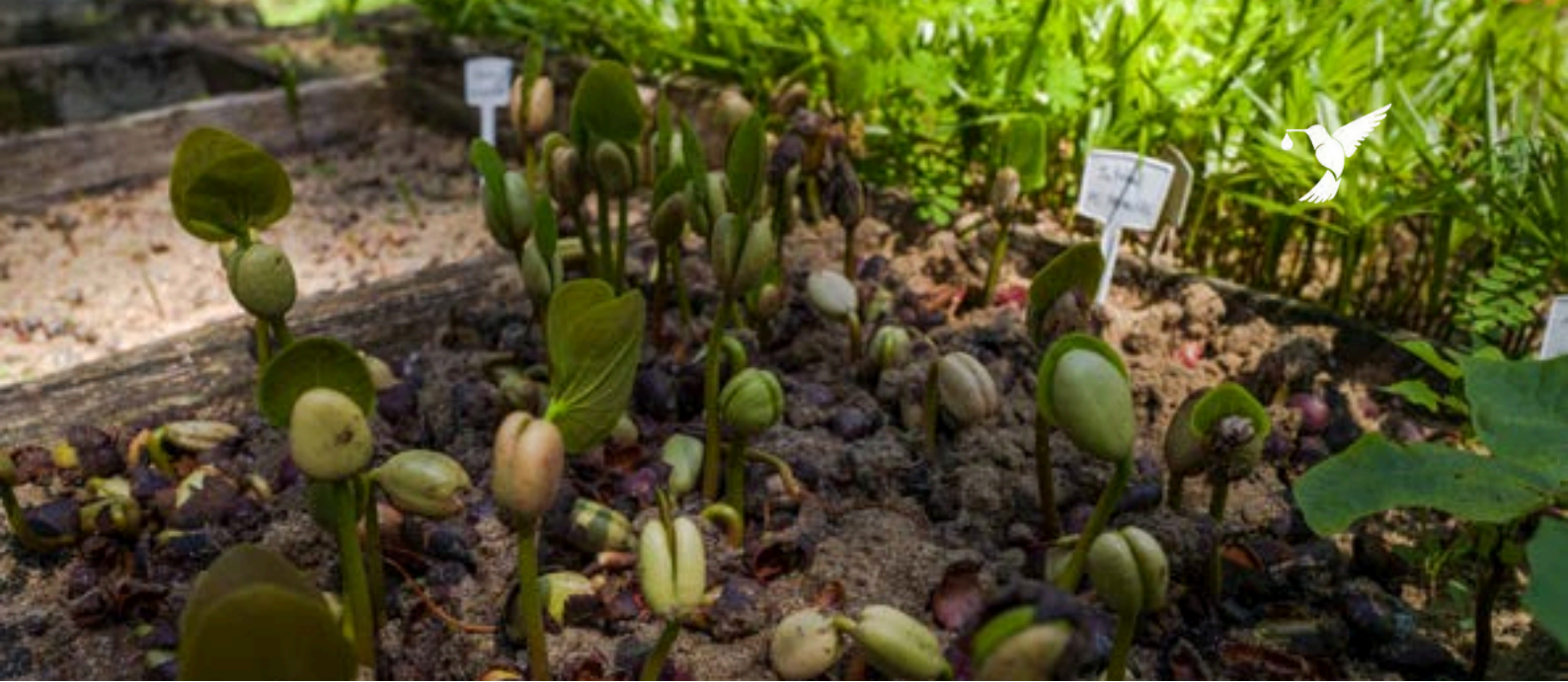
Number of hectares under restoration*